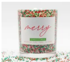
Merry Christmas Confetti Candles

We are stocked and ready to handle all your Christmas shopping needs, from spiritual needs, children's books and gifts, to hostess and girlfriend gifts. Come by after Liturgy to see what's new. Here are a few of our favorites below: