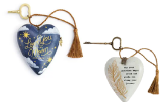
Sweet & Spiritual Musical Hearts