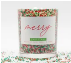
Merry Christmas Confetti Candles

We are stocked and ready to handle all your Christmas shopping needs, from spiritual needs, children's books and gifts, to hostess and girlfriend gifts. Come by after Liturgy to see what's new. Here are a few of our favorites below: