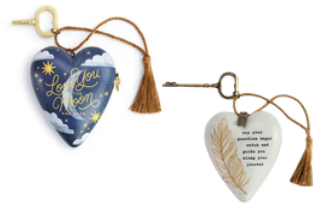
Sweet & Spiritual Musical Hearts