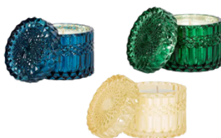
Beautiful Soi Candles