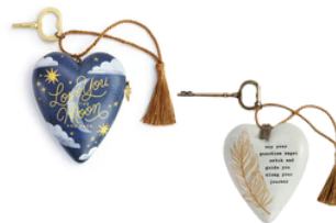
Sweet & Spiritual Musical Hearts