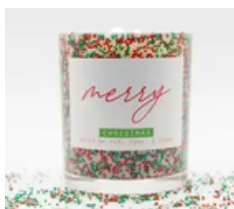
Merry Christmas Confetti Candles

We are stocked and ready to handle all your Christmas shopping needs, from spiritual needs, children's books and gifts, to hostess and girlfriend gifts. Come by after Liturgy to see what's new. Here are a few of our favorites below: